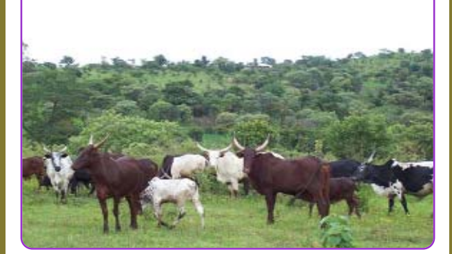
Animal rearing in Adamaoua province