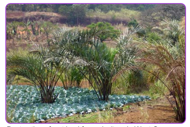
Destruction of wet land for agriculture in West Cameroon

16:00-16:30: presentation 4: The Role of African Legislators in combating climate change in Africa. The Nigerian Experience by, Hon, EZUICHE C. UBANI 16:35-17:05: The Role of Cameroonians legislators in Combating Climate Change in Cameroon by H.E, Hon AWUDU MBAYA Cyprian 17:05: Closing day 1 17:30: Dinner